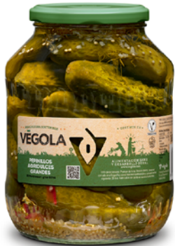
BIG BITTERSWEET GHERKINS