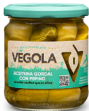
GHERKINS WITH GORDAL OLIVES Jar Size: 370B