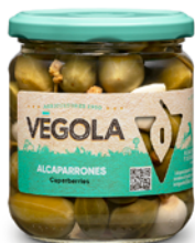
BIG CAPPERS Jar Size: 370B