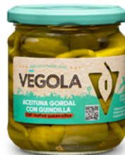
CHILLI PEPPERS WITH GORDAL OLIVES Jar Size: 370B