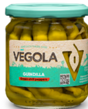
CHILLI PEPPERS Jar Size: 370B