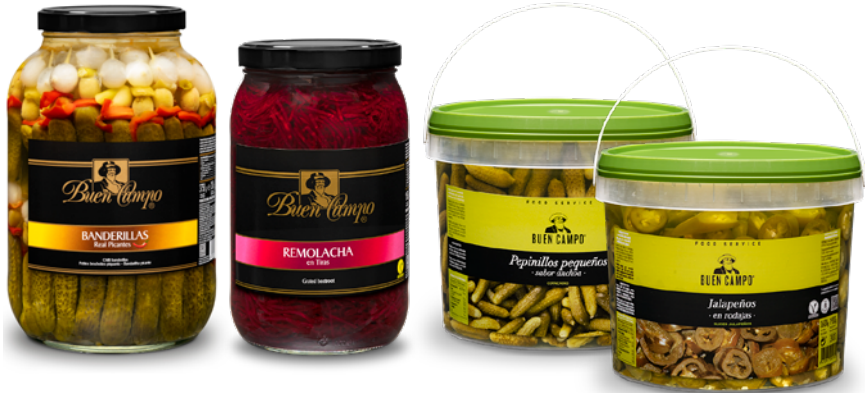
FOOD SERVICE BIG CAPACITY FOR PROFESIONALS