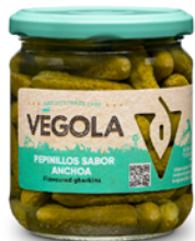
ANCHOVY GHERKINS Jar Size: 370B