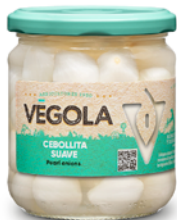
BABY ONIONS Jar Size: 370B