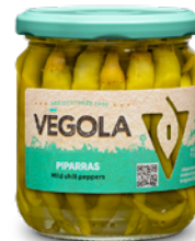
SELECTED CHILLI PEPPERS Jar Size: 370B