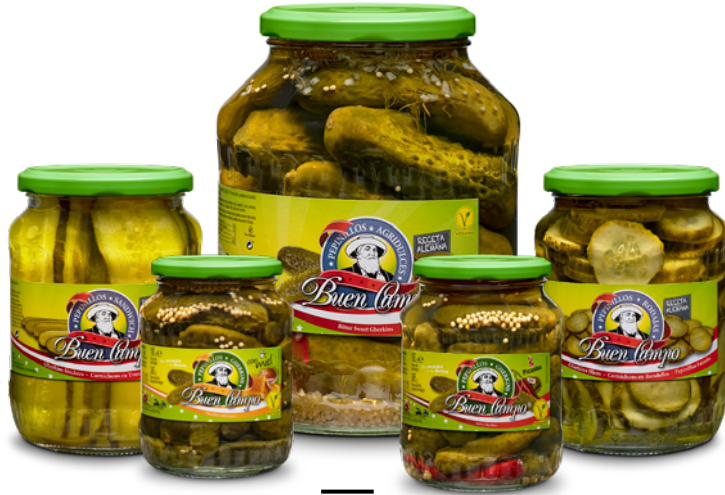
FRESH PACK A FRESH CLASSIC!