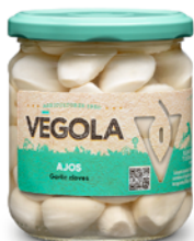
GARLIC Jar Size: 370B