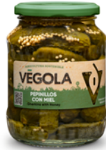
GHERKINS WITH HONEY