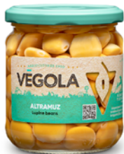
LUPINS Jar Size: 370B