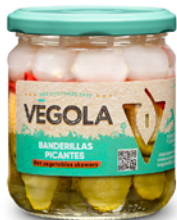
SPICY BANDERILLAS Jar Size: 370B