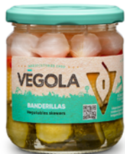
BANDERILLAS Jar Size: 370B