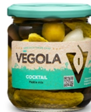
COCKTAIL Jar Size: 370B