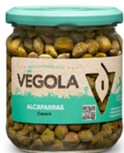
CAPPERS Jar Size: 370B