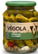
GHERKINS WITH CURRY